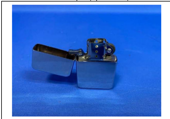
Test sample (open view)