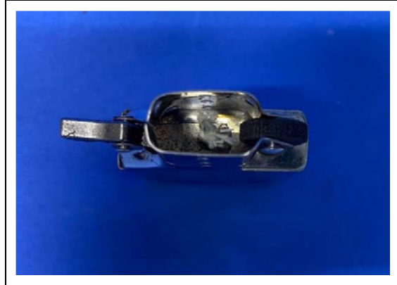
Top view of inset