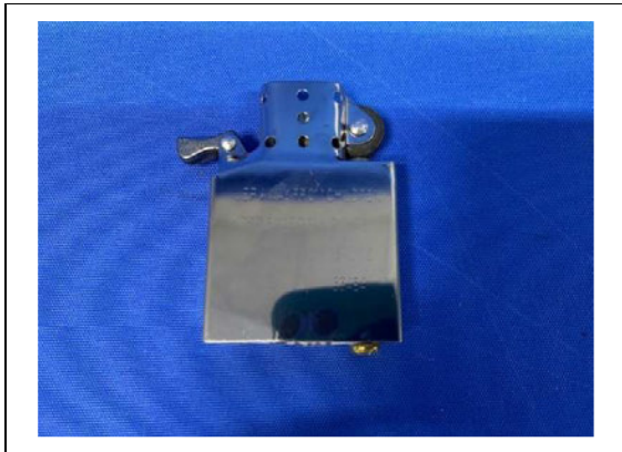
Front view of inset