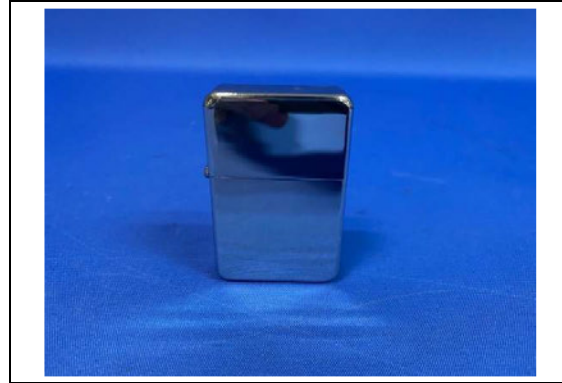
Test sample (front view)