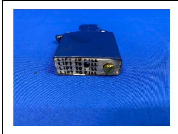
Bottom view of inset

SGS authenticate the photo on original report only